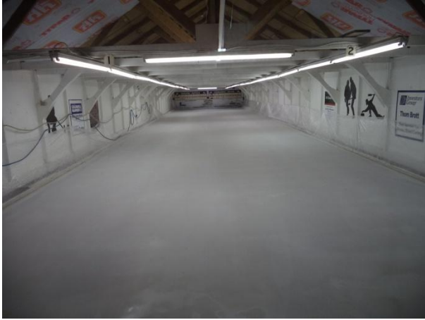
Ready for the circles.