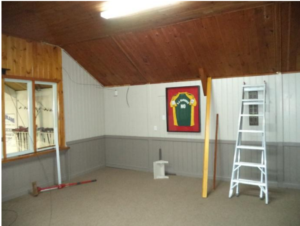
Waiting for our new tables and chairs.