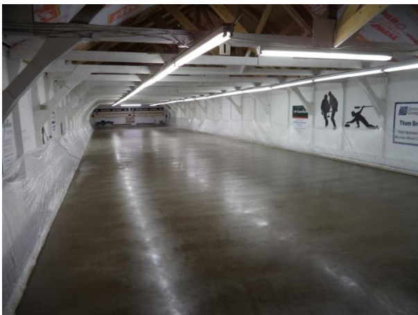
Ice is laid over sand base.