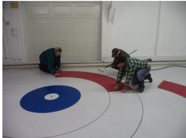
Adding the red circle.