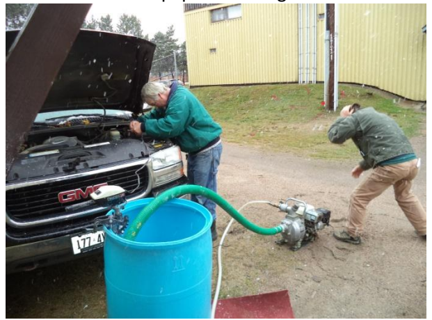
Preparing paint bucket..note trolling motor used as paint mixer and power source.