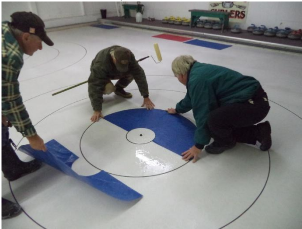
Adding the blue circle.