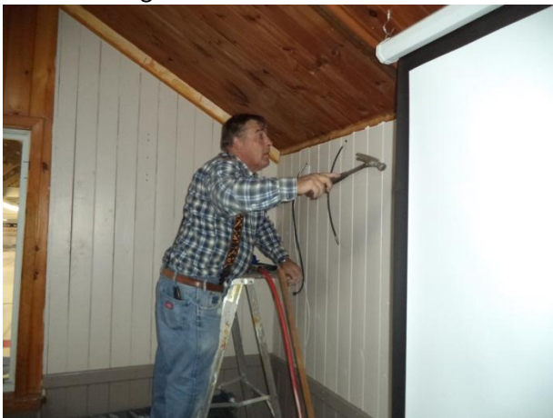
A new meaning for throwing the hammer.