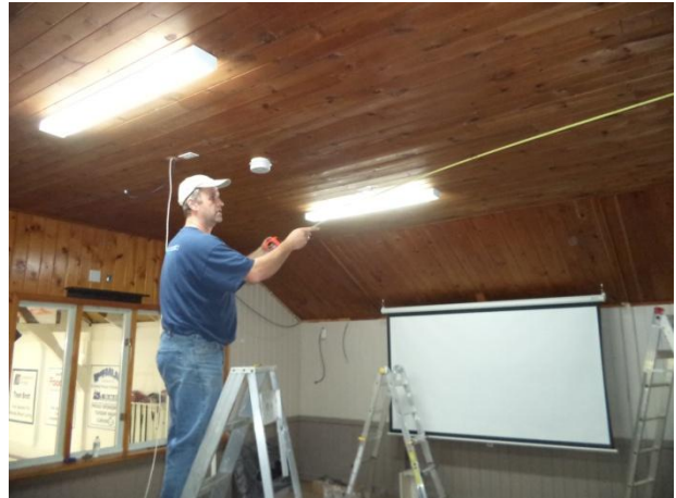
New A.V. equipment being installed.