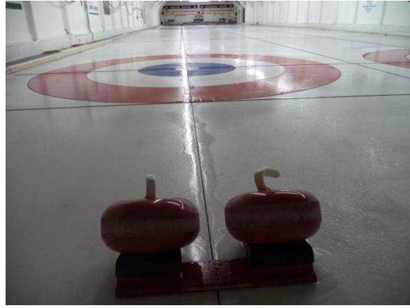
Where are the curlers?