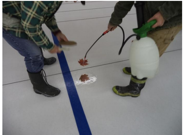
Adding the fall leaves.