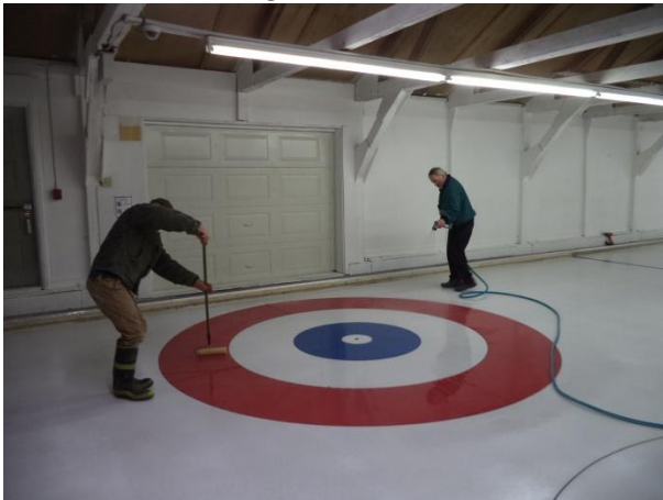
Making sure the circles are good.