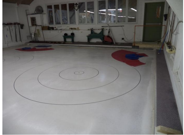
Circles are ready to be filled.