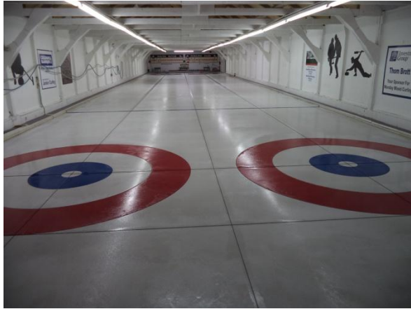
The rink looks ready.